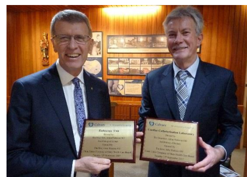
Blessing and Opening Of The Calvary St Vincent's Hospital Cardiac Catheterisation Laboratory and Endoscopy Unit

On Tuesday 12 th September over fifty guests helped officially open our services.